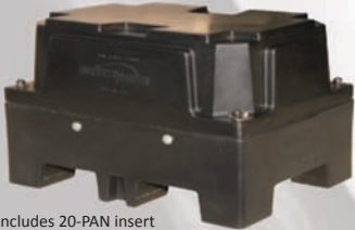
32" Auto Transmission Container