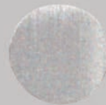
Funnel Filter Part #6119

Heavy Duty Funnels are available in 8" (203mm) and 14" (356mm). Funnel reservoir is either round or "D" shaped. Funnels feature an anti-splash lip around the top and the spouts neck down to 11/16" (17mm) but can be cut off up to 2" (50mm) for faster flows. A Stainless Steel 115 micron filter can be added to any funnel.