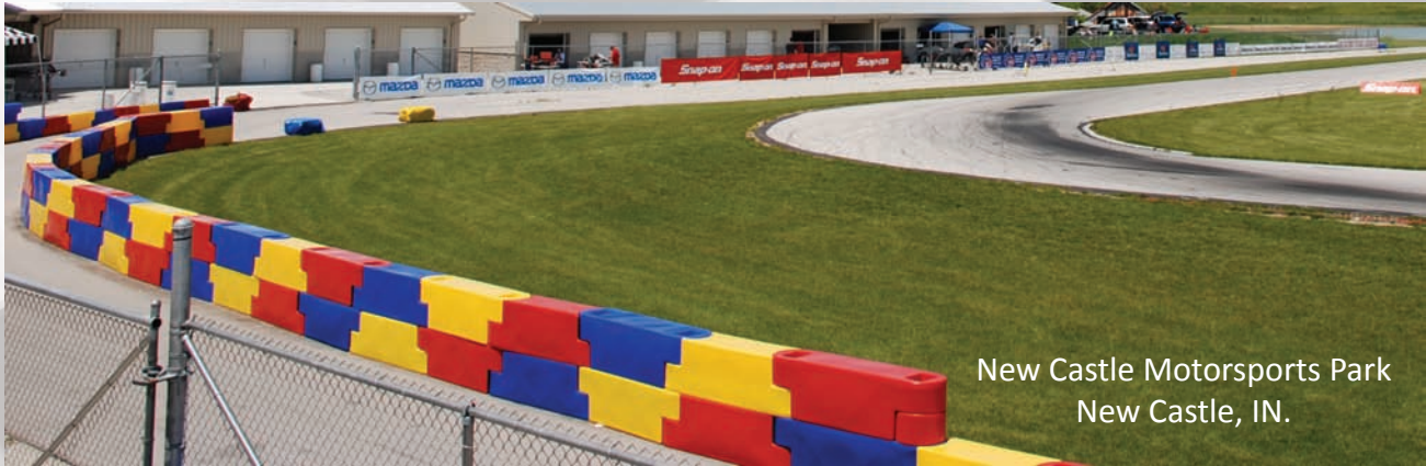
New Castle Motorsports Park New Castle, IN.

The Link Barrier System is a unique design that benefits track operators and racers alike. Designed for Auto Ovals, Road Courses, Racing Karts, Concession Karts, Motorcycles, Pocket Bikes and Quarter Midgets. Quick setup and flexibility make almost any layout possible. Available in three heights, 18", 36" or 54". With our complete line of accessories, your track can be transformed into a unique and participant pleasing venue.