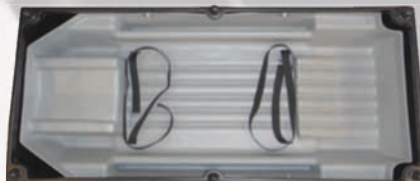
Top view of 25-PAN insert with cinch straps