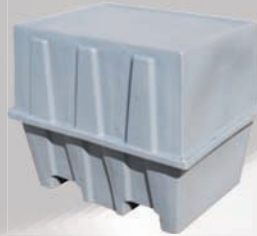
V-8 Big Block Case