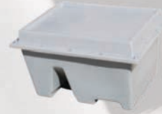
SB Chevy Bare Block Case