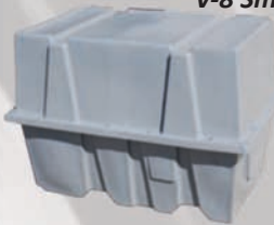
V-8 Sm Block w/Bell Housing