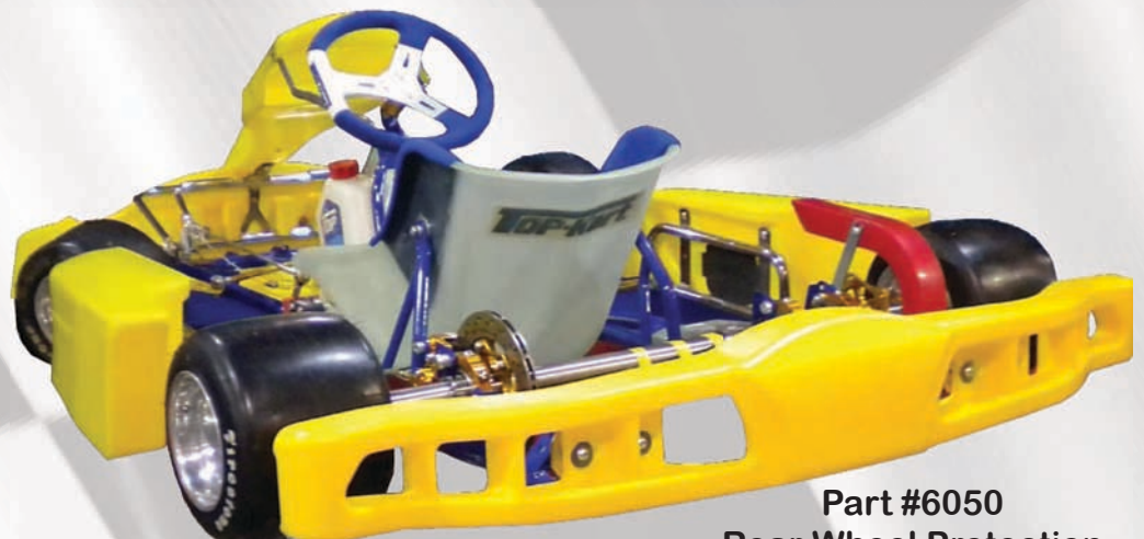
Part #6050 Rear Wheel Protection