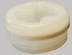
3/4" Lid Plug Part #5224