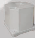
Go Kart Engine Case