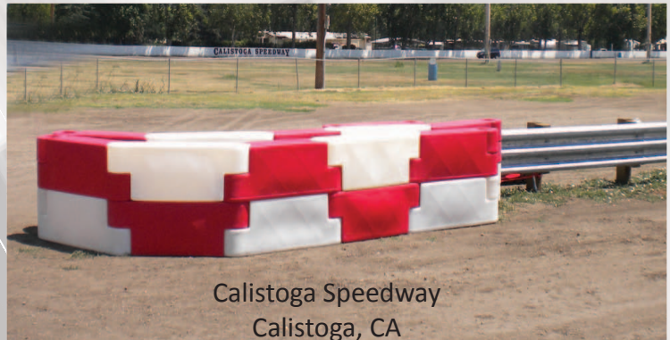
Calistoga Speedway Calistoga, CA