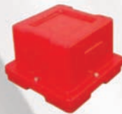
Holley 4150 Carb Case