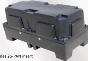
46" Auto Transmission Container