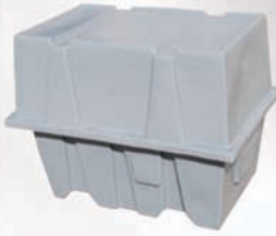
V-8 Small Block Case