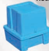
Rear End 3rd Member Case