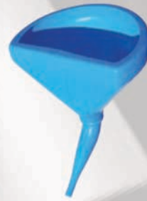
14" D Shaped 45° Part #6115