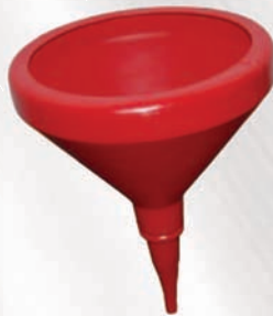
14" Round Part #6112