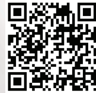
BodyLine 2.0 6000 Series

Light weight & superior aerodynamic styling make this extremely durable bodywork a choice of champions. Molded from polyethylene with a smooth glossy finish for best adhesion of graphic kits. A built-in shelf under the fairing for the data acquisition systems. The Rear Wheel Protection bumper has an advanced aerodynamic design ideal for higher speeds. Mounting kits for the rear bumper are available. Manufactured in and economically priced for the North American market in many popular colors.