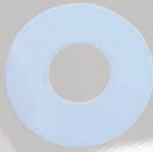
Gasket Part #5222