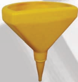
14" D Shaped Part #6110