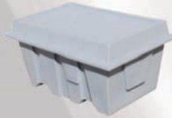
V-8 Small Short Block Case