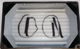
Top view of 20-PAN insert with cinch straps