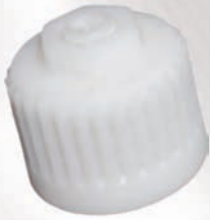
Complete Lid Part #5221