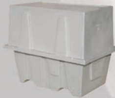
V-8 Sm Block w/Injectors