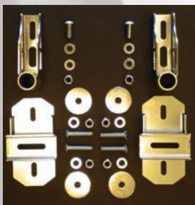
Part #6055 Mounting Kit

Light weight & superior aerodynamic styling make this extremely durable bodywork a choice of champions. Molded from polyethylene with a smooth glossy finish for best adhesion of graphic kits. A built-in shelf under the fairing for the data acquisition systems. The Rear Wheel Protection bumper has an advanced aerodynamic design ideal for higher speeds. Mounting kits for the rear bumper are available. Manufactured in and economically priced for the North American market in many popular colors.