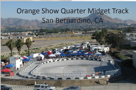
Orange Show Quarter Midget Track San Bernardino, CA